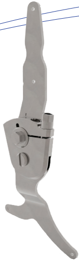
Model 3A75 Triple Action® Ankle Joint With Tapped Swept Stirrup