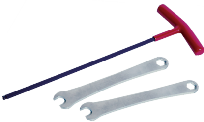
Model 3A00-ATK Adjustment Tool Kit