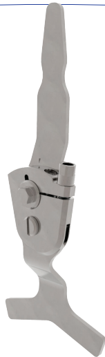
Model 3A76 Triple Action® Ankle Joint With Y-Stirrup