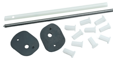
Model 3A00-FTK Fabrication Tool Kit